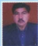
From the desk of Honorable Vice-Chancellor

I am delighted to know that 1 year B.Tech. students of CTAE are regularly publishing the monthly News letter CTAE Times. I am told that the News letter covers monthly events organized in the institution and showcases the literary and technical creativity of the students. While the publication of such news letter by itself is a creative activity, it enhances the communications skills, helps in personality development and fosters team spirit of young students. These days engineering graduates should not only possess required technical skills but also must have good communication and interpersonal skills for better placement as well as for job security. I am happy that the students of CTAE have taken a step forward in this direction. The CTAE has earned a good name for itself at the national level. This has been made possible not only due to the incessant efforts made by faculty and staff but also due to hard work and competence development made by students.