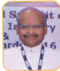
Hon. Justice Thiru. Karapaga Vinayagam Former Chief Justice Jharkhand