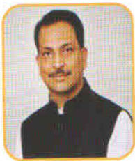
Hon. Shri. Rajiv Pratap Rudy Minister of State (Independent Charge) Skill Development & Entrepreneurship Government of India